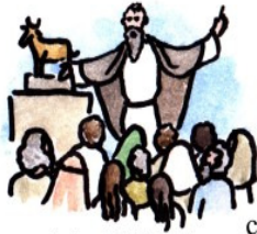
Joshua 24:1-2, 15-18

In today's first reading, Joshua told the people that they had to choose between the false gods and the true God. Joshua and the people chose to worship the true God.