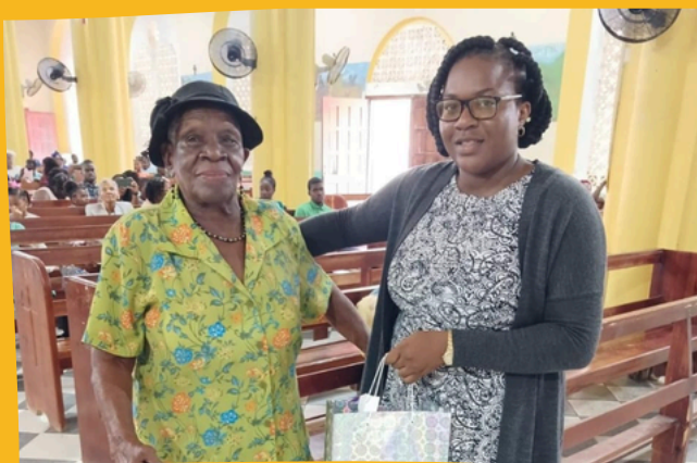
90 YEAR OLD MOTHER BEING HONoured AT ST LUCY'S PARISH