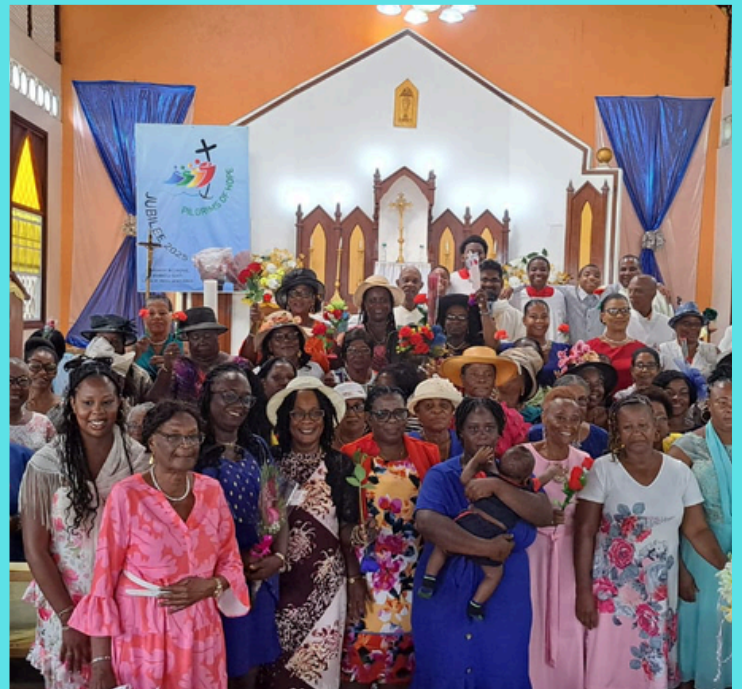
MOTHERS' DAY CELEBRATIONS