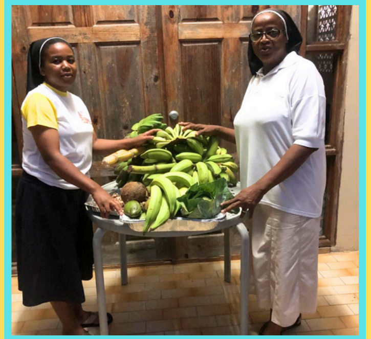
ST BENEDICT DISTRIBUTING FOOD FROM THE JUBILEE OF FARMERS TO THE VARIOUS HOMES