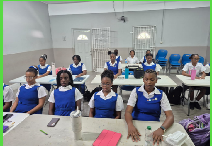
ST JOSEPH'S CONVENT