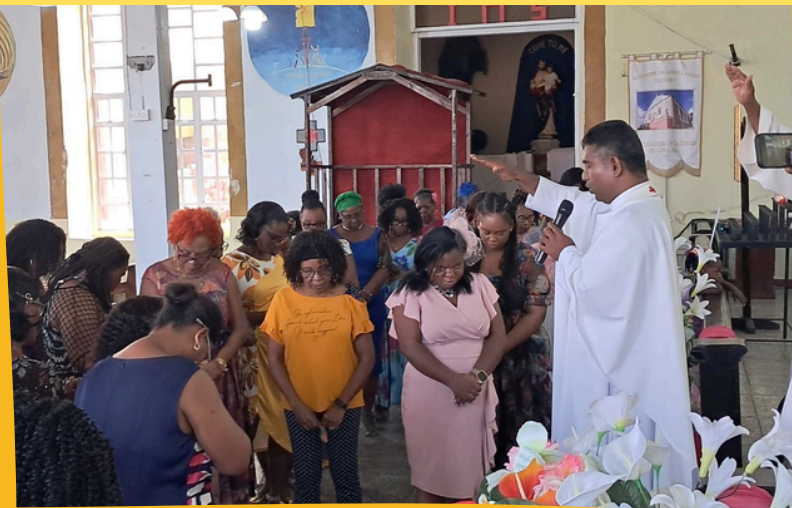
JUBILEE OF MOTHERS - SAINT PETER'S PARISH