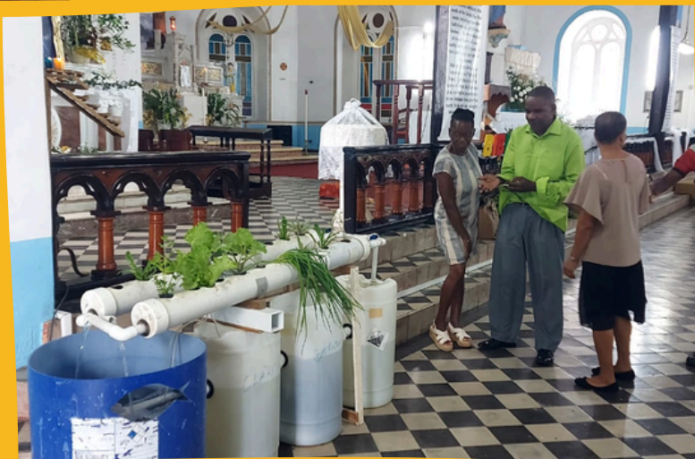
OUR LADY OF THE NATIVITY