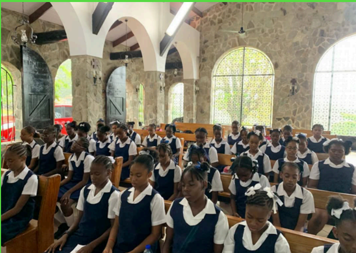
AVE MARIA GIRLS PRIMARY