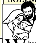
The Family of God.

Why did Jesus choose to become a baby born of a mother and father and to spend all but His last years living in an ordinary human family? In part, to reveal God's plan to make all people live as one "holy family" in His Church. In the Holy Family of Jesus, Mary, and Joseph, God reveals our true home. We're to live as His children, "chosen ones, holy and beloved".