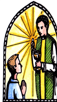
Answer to Word-Find: MY LORD AND MY GOD

3. After receiving Holy Communion, take some time to thank Jesus for coming to you and talk to Him. He is your best friend and loves spending time with you!